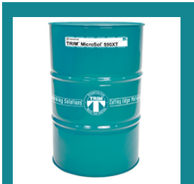
54-gallon drum SKU: MS590XT/54 UPC-12: 641238074434