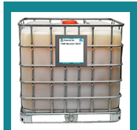
270-gallon tote SKU: MS590XT/NR270P UPC-12: 641238074472

TRIM ® MicroSol ® 590XT | ©2015-2021 Master Fluid Solutions ® | 2021-12-27