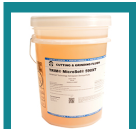
5-gallon pail SKU: MS590XT/5 UPC-12: 641238074441