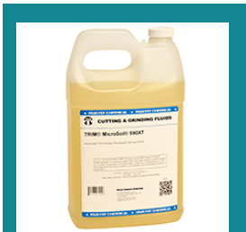
1-gallon jug SKU: MS590XT/1 UPC-12: 641238074458