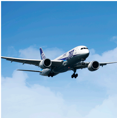
Photo by Kentaro IEMOTO, is freely licensed work, as explained in the Definition of Free Cultural Works.